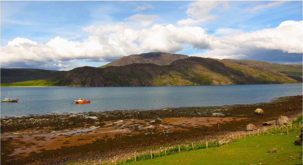
Photo above: Little Loch Broom on the Northern Scottish mainland, a ‘fjordic’ sea loch.