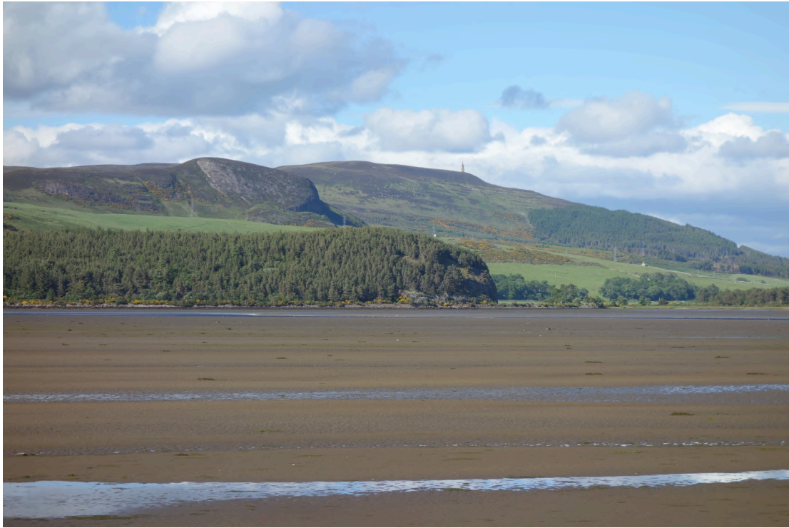
Photo above: Loch Fleet close to Embo in the traditional Gaelic speaking area of East Sutherland, showing a firth in a typical northeast coast landscape. When visiting this region I was very fortunate to meet the only two speakers of the dialect in Embo. I am grateful for this and remember it in my heart. Wilma has sadly passed away, god bless her and I thank her for her beautiful kindness. Amen

One difference of east Sutherland Gaelic which is recorded in the Survey of the Gaelic dialects of Scotland (1), is that initial broad g is pronounced [x] when under lenition. For example A' Ghàidhlig could be spelt something like a' Chàilig . The differences are too numerous to include here, but, some of the features of this dialect are generic things associated with Northern Gaelic dialects, for example n frequently becomes r. This is not limited to Northern Scotland but it occurs arguably in a much larger number of words in Northern Scotland. (Especially in East Sutherland, and some islands and N. areas)