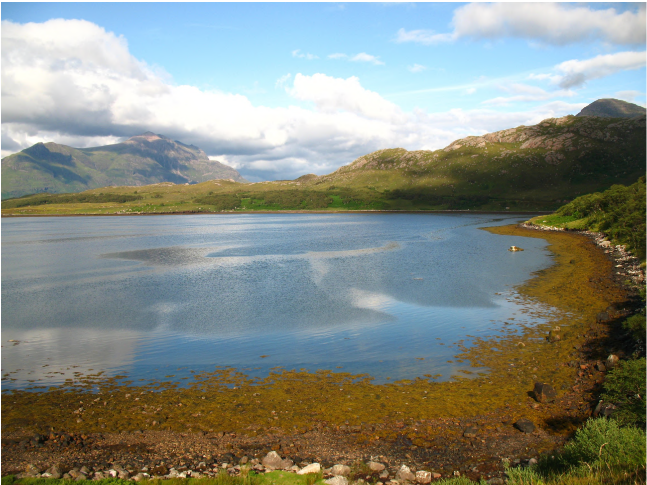
Photo above: Òb Mheallaidh , a shallow lagoon-like bay just to the south of the main Loch Torridon, Gaelic: Loch Thoirbheartan . I hope that this photo helps to give some idea of the majesty of this landscape. In my opinion this small area of the Scottish mainland has some of the best preserved natural environments in Scotland, both in terms of the indigenous Scots pine forests and in terms of the marine diversity. In this lagoon, I walked out some way

All examples or information marked with (1) indicate a reference to the Survey of the Gaelic dialects of Scotland edited by Cathair Ó Dochartaigh, and in this article all of these references are specific to the language of informant 118 from Torridon. Note that in some cases the phonetic spelling in (1) or simplification thereof is not given, and in these cases a reference to (1) may indicate that I have spelled Gaelic orthography for Torridon slightly differently according to some of the phonetic information in a word from (1), this includes for example spelling snaim - 'knott' as snaimb .