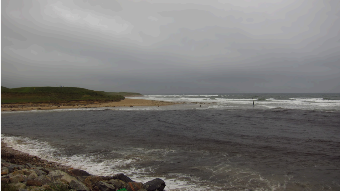
Photo below: another part of the East Sutherland coastline, close to Golspie.

A change from [a] to [o] or [ɔ] is relatively common across Scottish Gaelic, this change is very common in certain words, in dialectal areas around the country. But in Northern Scotland one could argue that this change is somewhat more common, and the phoneme [ɒ] also occurs in East Sutherland. This I write as â , for example informants 142 and 143 in (1) have this sound in falamh – ‘empty’, which could be written here as fâlaí , the final vowel being pronounced close to [i] presumably but I am not certain on the exact pronunciation from the dialect survey. Another example is fairrge – ‘sea’, which, in the language of informants 142 and 143 (1) could be written as fârig . Note that the [g] in this word is likely close to the English [g]. The verb dh’fhalbhadh – ‘would go’ might be written as ch’fhâlu in the language of informants 142 and 143 (1).