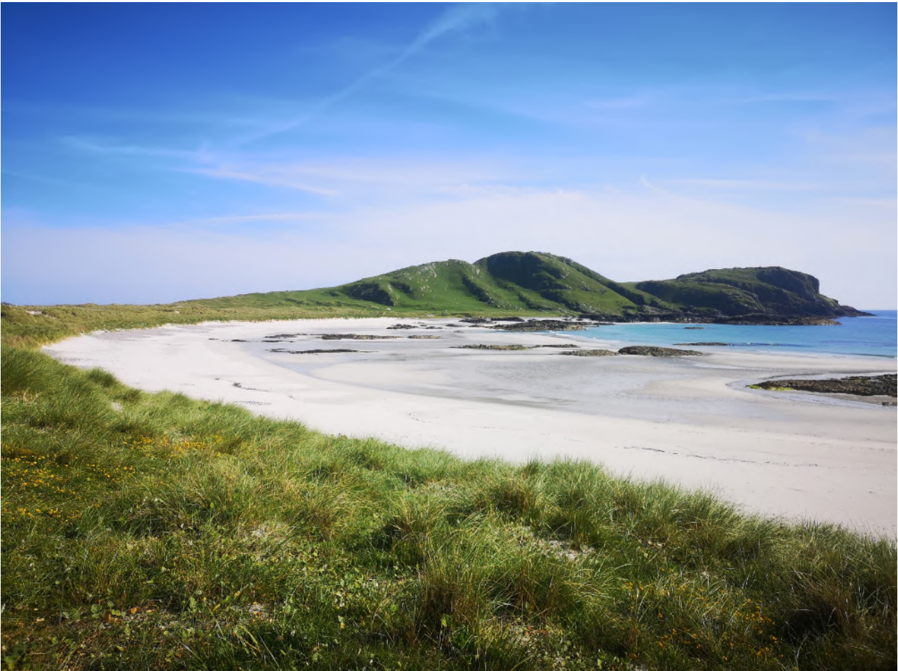
Photo below: the headland at Ceann A' Mhara , showing what would have once been an island. The fort of Dùn nan Gall did not appear easy to access safely, and a large, deep 'geo' (Gaelic geodha ) stopped me from going any further.

have been connected to the sea, and it is likely that the sea ran all the way to Loch Bhasapoll to the north of Loch A' Phuill , across the flat landscape around Barrapoll . Interestingly the location of the church just across the marsh/flatlands from Barrapoll may have originally faced the sea; of course it would not have been a Christian church back then, but the Christian Church may have been built upon an older sacred site, especially considering that there are several standing stones and what appear to be cairns within walking distance. This leads us onto the topic of brochs and forts in general, both of which in Gaelic are generally referred to as dùn 'enclosure'. Close to the mountain of Ceann A' Mhara in the southwest corner of Tiree there are two enclosures of forts; interestingly one of them is referred to as Dùn nan Gall – 'fort of the foreigners'. Back towards Baile A' Phuill there is an enclosure very close to the coastline, referred to as Dunan Nighean and described by some locals as being a 'Danish' fort. According to the page for this site on www.megalithic.co.uk (The Megalithic Portal) evidence of midden material was found here, but I am unsure whether or not this means a shell midden.