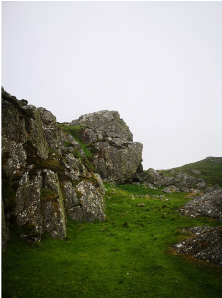
Photo below: the curious rock formation upon which stands the broch of Dùn Hiader .

I wanted to go on from here and visit another dùn some way to the east, but instead I felt this feeling, like a whisper, suggesting that I go down to the beach below the broch. I safely found my way down from the rock formation, for on the side away from the sea there is the remnants of a path. Just behind the beach, and near to the base of the fossilised giant-looking rock formation,