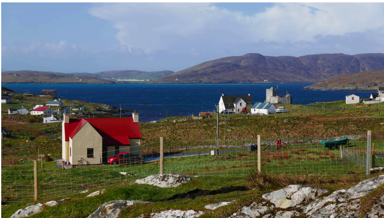
Photo above: another view of Castlebay Harbour on the Isle of Barra.

Above: the sacred island of Barra in the Outer Hebrides, showing the CalMac ferry at Castlebay, Bàgh a' Chaisteil , with Kisimuil castle to the left.