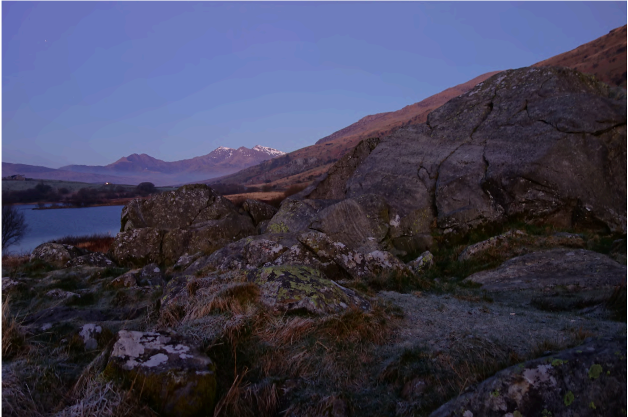
Photo below: looking towards mount Snowdon, Yr Wyddfa on an early winter morning. This is a landscape which is deeply connected to the Modern Welsh language, and mythologically speaking and within the landscape to Middle Welsh.

This is a short guide to the pronunciation Welsh language before the 1500s, the language which was used to write some of the earliest poetry in Britain and which was the way we got many of our Welsh stories and legends today. This writing was based on what I know of Middle Welsh.