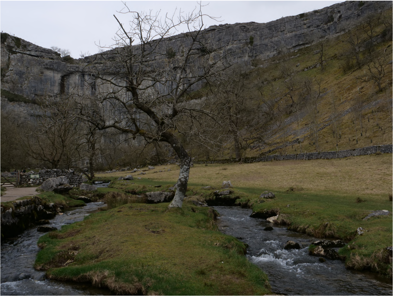
Photo above: landscape near Malham in North Yorkshire, a place where there appear to be a large number of medieval and possibly Iron Age Celtic field systems.

For the last article in this book I want to talk briefly about this area. These limestone uplands have been inhabited since the Mesolithic and Neolithic times, and perhaps the 'Cumbric language' is actually connected to those peoples. Even though Cumbric is sometimes described as being more or less identical to Old Welsh, the roots of the language in the landscape, which are often shared with Welsh, often have a quite obscure and possibly non-Indo-European etymology. So Cumbric is definitely connected to Welsh, but does that make the ancient language of this land Celtic necessarily? I am less certain. An example of a Cumbric place-name is Pen-y-Ghent. Even though it looks like Welsh, and the word pen is most definitely connected to Welsh pen – head, and the definite article y – 'the', 'of the', is the same, the third element, Ghent is of unknown etymology, and I do not think that a meaning of 'head of the border' or 'head of the wind' really fits, which I did think in the past, owing to the similarity between Welsh gwynt – wind, and Ghent. I do not think this fits semantically. I hope you enjoyed this book :)