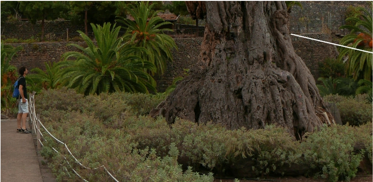
Photo below: the Drago de Icod de los Vinos , an ancient dragon tree of the Canary Islands, a Dracaena Draco , with the author (30 years old) stood to the left of the tree, July 2023. Notice the giant female goddess shape on the right side of the tree's trunk, almost like her form is physically at one, and conjoined with the tentacle-like shapes of the tree. The white line from the right side of the photo, points to the cephalopod goddess shape in the tree. Photo taken by Ania for the author (myself) who is in the picture.

The tree is thought by some to be over a thousand years old, although different studies have suggested different ages for this tree. According to this web page: http://lacantimploraverde.es/drago-icod-los-vinos-tenerife-parte-2-2/ , the age of the dragon tree may be in the hundreds of years, but, according to this webpage, authors such as Lázaro Sánchez-Pinto Pérez-Andreu base the calculation of the tree's age upon the growth of the trunk roots, and according to this method the Drago de Icod de los Vinos is over a thousand years old. (Regardless of age it is certainly a sacred tree to the islanders)