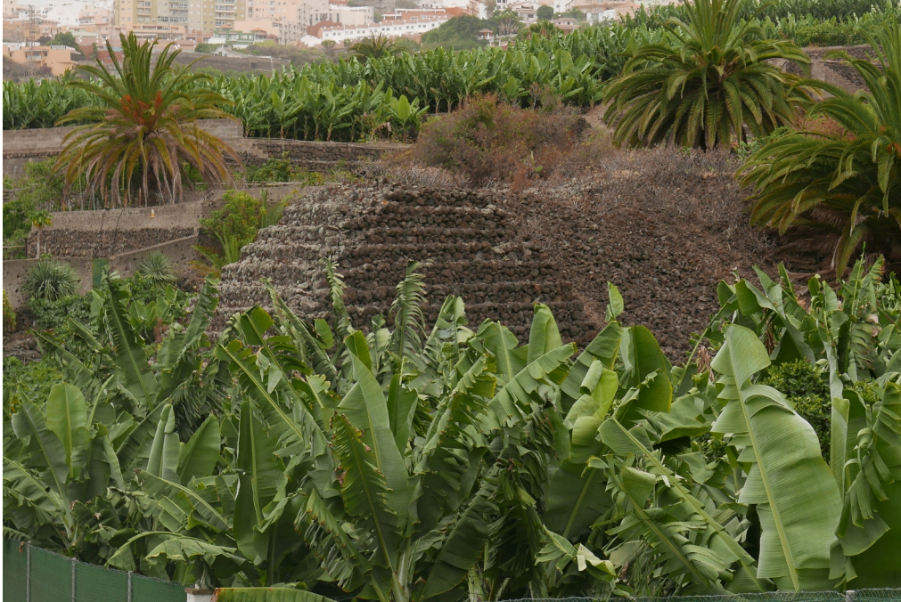
Photo below: San Marcos Pyramid 1, one of the San Marcos pyramids within a banana plantation and on private land, this photo shows the pyramid from a higher angle, with two sides to the pyramid clearly visible. To the right is what may have been another part of the same pyramid.

It is possible to see El Teide, or in Guanche: Echeyde , from many of these pyramid sites, including this one. The second photo on this page (the photo below this writing), shows the San Marcos most visible pyramid, called here San Marcos Pyramid 1, with second possible pyramid to the left (San Marcos Pyramid 2). The name given to this area is pirámides de San Marcos with the plural for pyramid being employed, so I presume that perhaps this other, similarly walled structure of the same height as the pyramid and to the left of it, may also be a pyramid or a part of the most visible pyramid's structure. Whilst on the road close to the site, I spoke to a local man in Spanish who did believe the pyramids were Guanche and who considered himself to be a Guanche too. The coordinates of the main pyramid are: 28°22'27.6"N 16°43'20.6"W. The coordinates of the second possible pyramid, San Marcos Pyramid 2 to the left on the image below are 28°22'27.4"N 16°43'19.9"W.