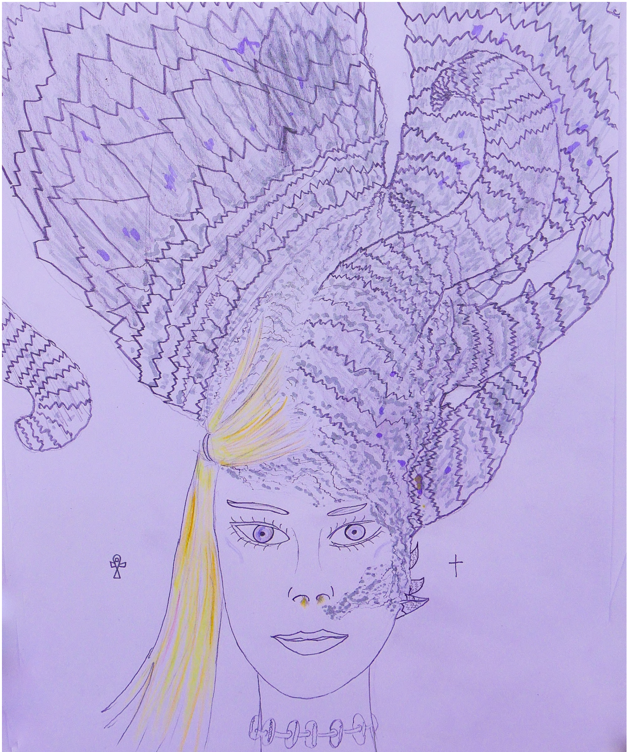
Photo above: another example of artwork showing a female adult goddess figure embodying the human form and the otherworldly “horned” consciousness, with blonde hair from her human “surfaces” and nose. The third and final piece of art in this book is on the lower part of the page after the next page, just after the references. (1 reference)