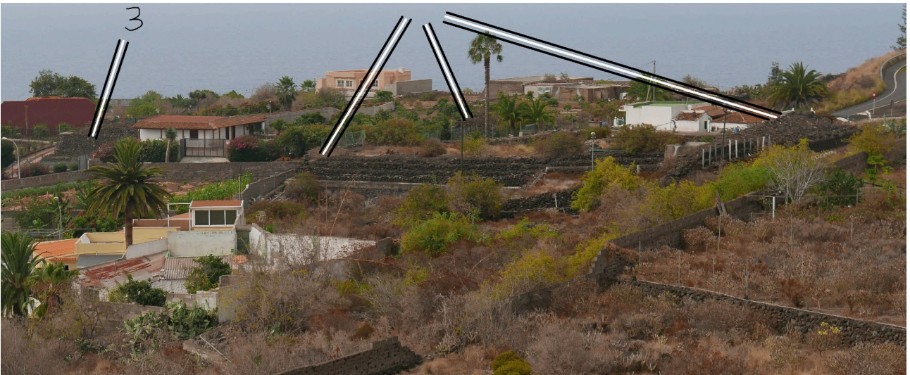
Photo above: some of the pyramids below La Manchica (see discussion on previous page). The number 3 on the left of this image and the lines heading away from it point to “La Manchica Pyramid 3”, whilst the other lines point to different parts of the potential “The Lower La Manchica pyramid-structure”. Note that the left-most lines point to a corner of the potential “larger structure” or “large pyramid” that the other parts may have attached to. The “long structure” is to the right, and the pyramid, or bit of the larger pyramid north of the road is pointed out by the central lines.

The photo below uses lines to point out “La Manchica Pyramid 4” and “La Manchica pyramid 5”, with the lines going to those pyramids from the respective numbers drawn onto the image.