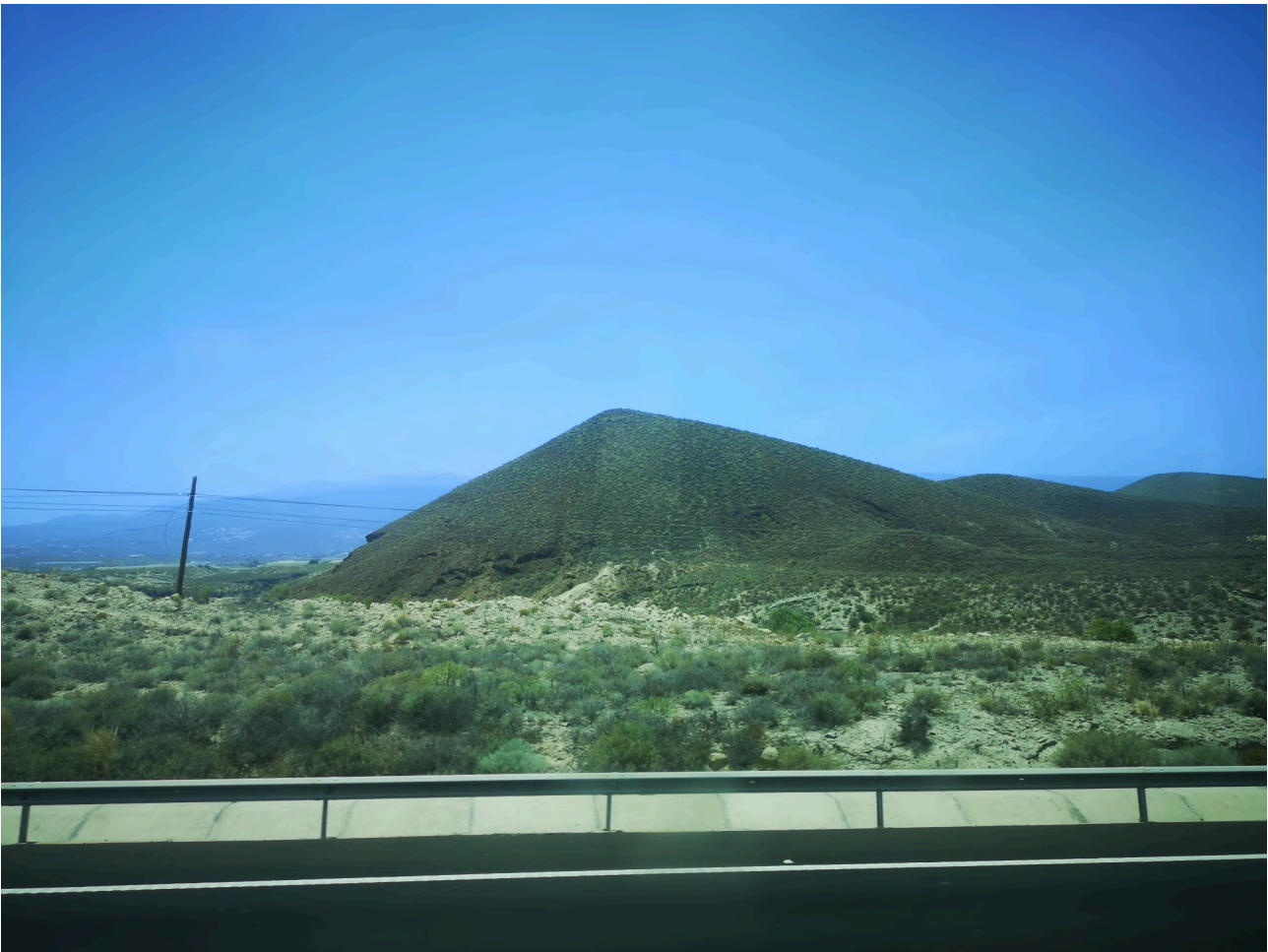
Photo above: the mysterious and magical Montaña de Ifara region of Tenerife, mentioned as potentially important in relation to a dream.