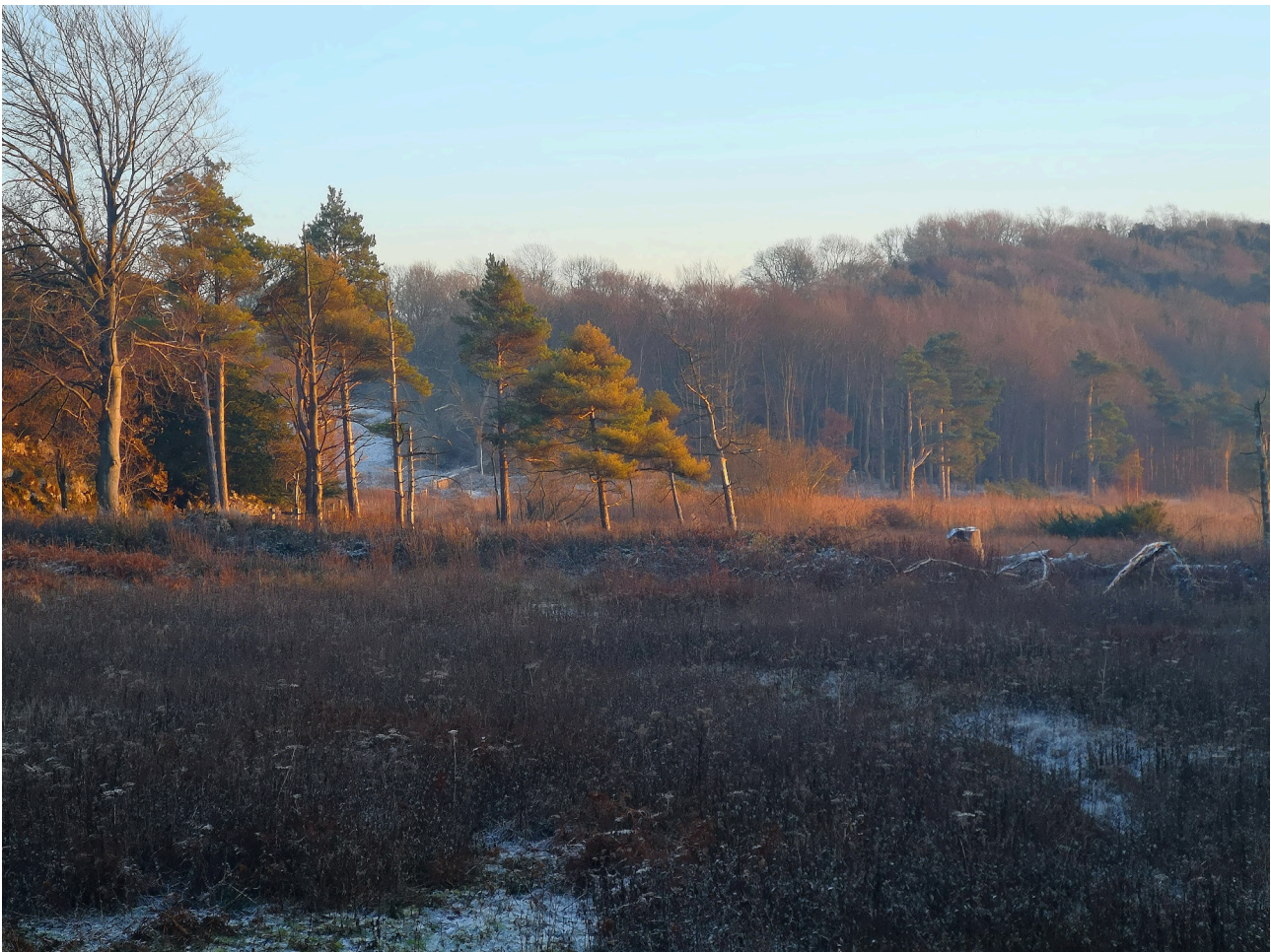
Photo below: Marshy land close to Hawes Tarn/Hawes Water in North Lancashire, a small marshy lake, or rather two lakes, for as well as Hawes Water there is also Little Hawes Tarn, where evidence of prehistoric people has been suspected before, according to local archaeologists. There are a number of potentially ancient sites which I have identified around this lake, and as the photo shows, the flora has not changed much since the Mesolithic times, with the Scots Pine trees visible for example.

Close to a bay alongside the footpath around Hawes Water, there is a large wall made of smaller, rounded stones, limestone pieces, and much larger limestone boulders, some several feet in diameter. Behind this wall, and inland where the bay is, are what appear to be several cairns, made of another kind of rock which is not limestone. Behind these small cairns there is