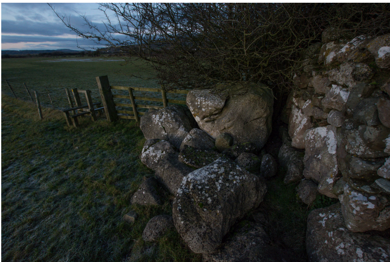
Photo below: part of what appears to be an ancient wall of megalith-sized stones, at Hunters Hill near Carnforth, at the edge of Morecambe Bay. Hunters Hill would have been an island, during those times in the past when the sea levels were higher than at present. The island is located close to the River Keer, the name Keer is I think very ancient.

.Ince-in-Makerfield - this place name, located further south in Lancashire, contains the same word as found in Irish as inis - island, Welsh ynys . Thus the word could be either Goidelic or Brythonic in origin. Although it has been derived from a Proto-Celtic possible form, there is also a similar word in the Sámi languages of northern Europe, which has lead me to believe it is more likely to be a pre-Celtic word than a Celtic word.