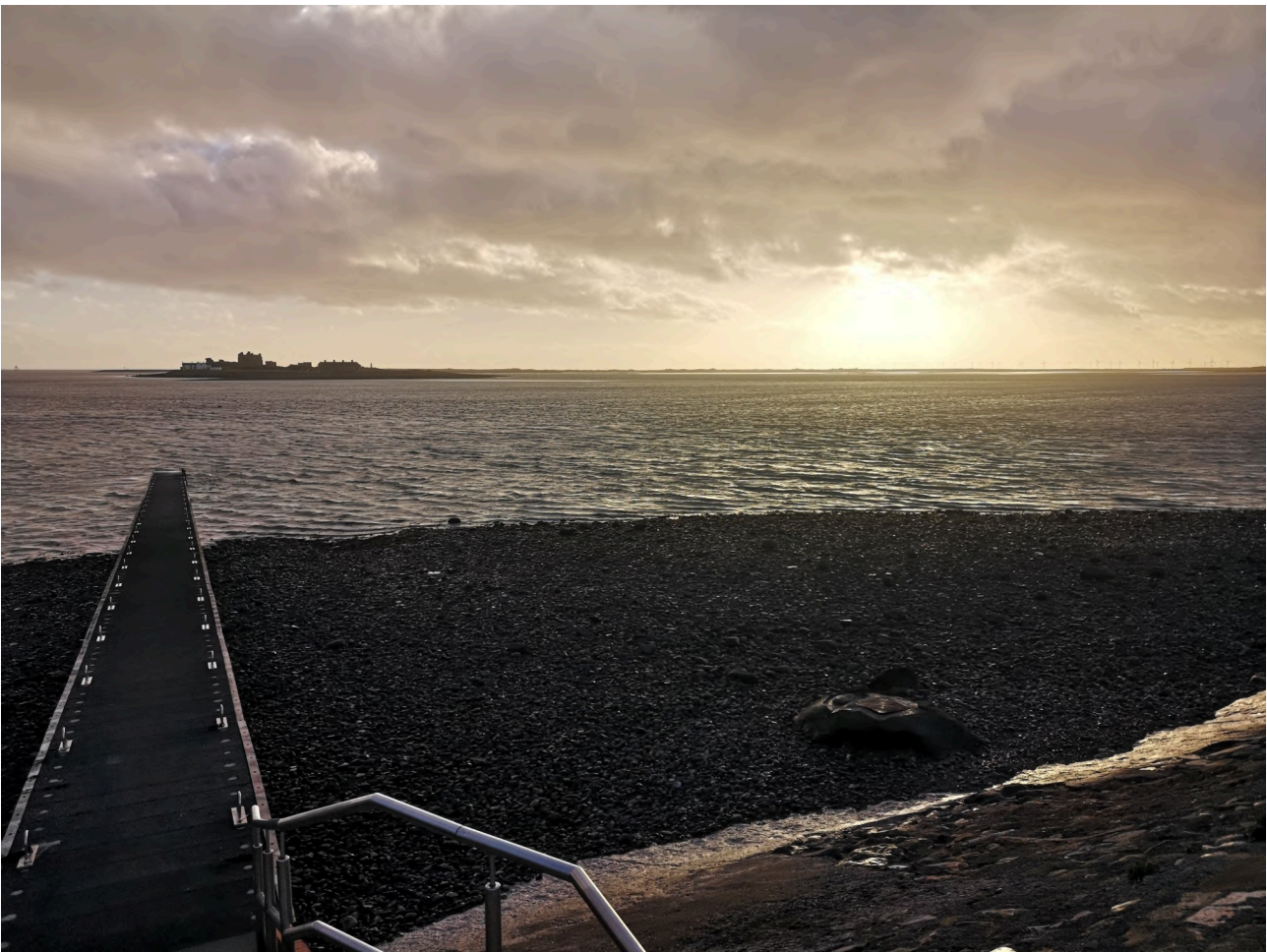
Photo below: Piel/Peel Island, taken from Roa Island. The dunes of Walney Island csn just about be seen on the left and in the distance. Does this small archipelago belong to a flooded landmass?

I had not been to Roa Island and Piel Island since around June 2009, when I went in summer on the ferry, from Roa Island to Piel Island. I went again yesterday for the first time since. Roa island is likely I think from the Anglo-Norse Ráey from rá – deer, and ey – island. Piel Island was originally named Fodderey, from Anglo-Norse Foderey – ‘fodder island’. Foulney is I think likely from Anglo-Norse Fughley – ‘bird island’, from fughl – bird, ey – island.