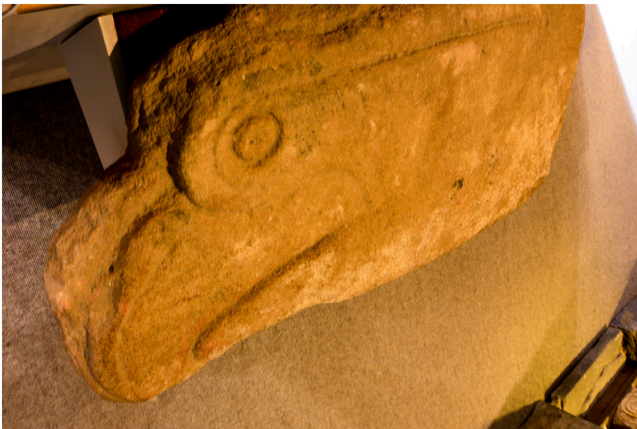
Photo above: the carved bird's head which was found close to St Patrick's church at Heysham.

Note the similarity to the Haida Thunderbird depicted in the image below this, despite the fact that these cultures were never in contact. Despite that these cultures were not in contact, I feel that indigenous American peoples can help people in Europe to rebuild a picture of our own spiritual beliefs and traditions from the ancient past, especially if the 'Thunderbird' and similar concepts to the Thunderbird were once part of a widespread system of symbolism and belief across parts of the ancient world.