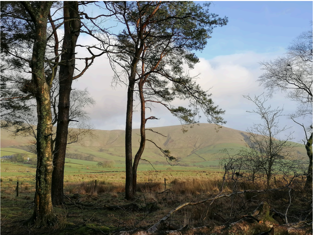
Photo above: this small forest is the site of an ancient, Bronze Age timber circle, located in the valley of Bleasdale in Bowland, Western Lancashire. This landscape represents where the flat coastal plain of the Fylde becomes the hills of Bowland. Although there is no way to say for sure if this timber henge was connected to the Setantii tribe, Bleasdale would certainly seem to be in the right area, judging by where the names Portus Setantiorum and Seteia are located on Ptolemy's map. The valley would have been facing the marshlands, tidal lakes and Irish Sea.

A similar, but much larger timber circle is located at Dunragit in Galloway in Scotland. Just like the Bleasdale and 'Setantii' area, Galloway also has, linguistically, a mixture of seemingly P-Celtic, Q-Celtic, Norse and Anglic elements.