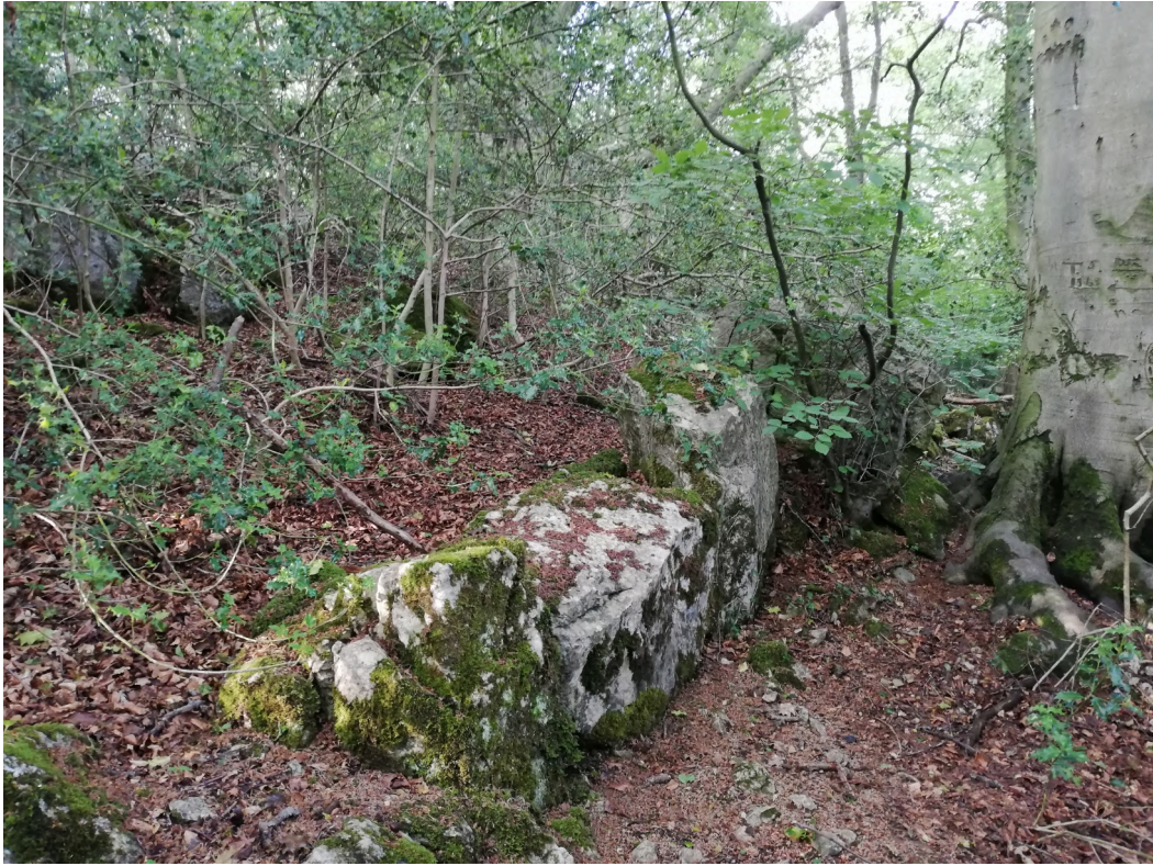
Photo below: the same wall visible moving away from the camera and towards the left, showing the wall from the opposite direction to the photo above.