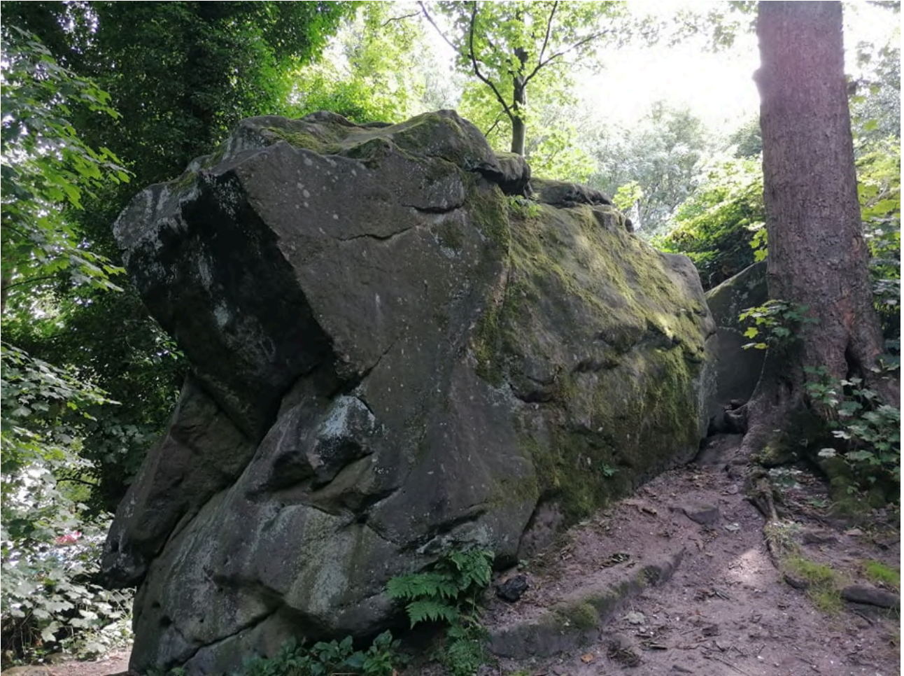
Photo above: the ancient sandstone crags, close to St Patrick's church at Heysham. Some of these crags contain small caves, some of which appear to have been partially altered by man. The shape of the crag itself is curious, with some 'bowl-like' depressions which bare a resemblance to crude stone-cut graves. In the past, the crag became part of a walled garden, although I think it possible that at least some of the stone masonry in the walls and terraces here is somewhat older than the walled garden, but this is purely speculative.

There are also a number of marking in the sandstone crags, including a rather old looking cross symbol. The date of this would be hard to estimate, but I am sure that it has been dated in some way. Some of the other markings appear also deliberate, and to have the form of cup marks, but it is difficult to tell whether or not these are simply erosion from rain.